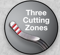
Multi-Cutting Deburring Blades