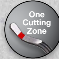
Conventional Deburring Blades

Multi-cutting edge deburring blades last up to 3 times longer than conventional blades due to their unique design. Raised guides add extra cutting zones which extend blade life.